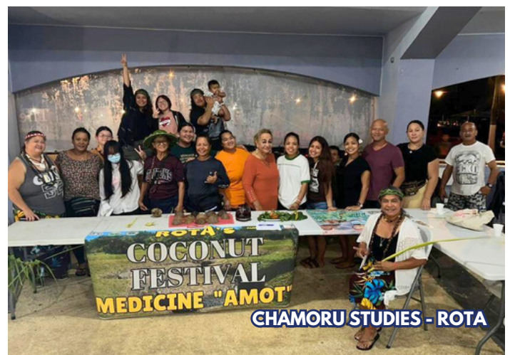
CHAMORU STUDIES - ROTA