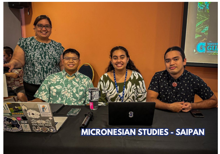
MICRONESIAN STUDIES - SAIPAN