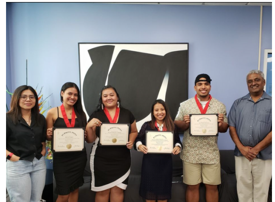
POLITICAL SCIENCE HONOR SOCIETY