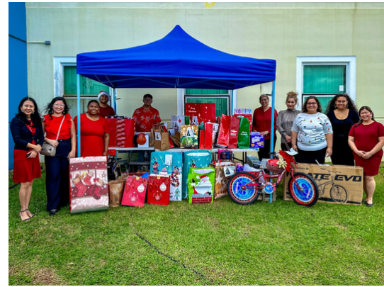
DONATIONS TO ALEE SHELTER